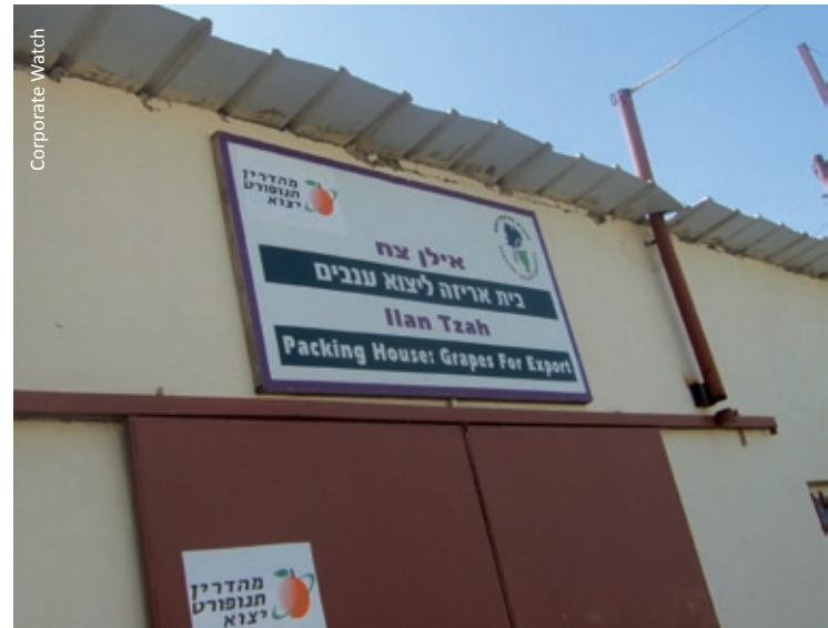
Mehadrin logo in Hebrew on a building in the settlement of Beqa'ot

Mehadrin also collaborates with Mekorot, the Israeli state water company, to supply water to its farmers and thus participates in the appropriation of Palestinian water. Workers in Mehadrin packing houses have spoken of grossly exploitative working conditions.