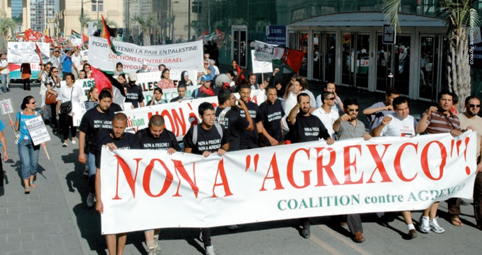
More than 1,000 people marched through Montpellier in 2009 in protest at Agrexco's plans to build a terminal in the nearby port of Sète. The campaign against Agrexco spread to 13 countries and was a major factor behind its collapse in 2011.