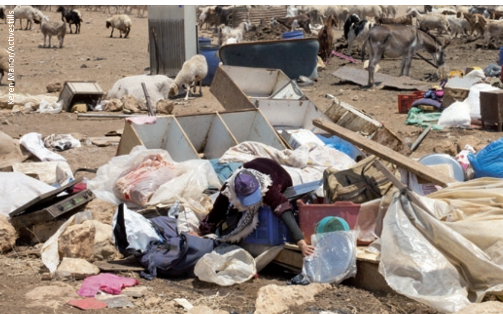
Left: A woman sifts through the ruins of her home after a demolition in the Bedouin community of Al Hadidye that left 32 people homeless. Agricultural export company Mehadrin operates in the nearby Beqa’ot and Ro’i settlements.

Israeli agricultural companies also undermine Palestinian production by dumping produce into the Palestinian market at times of peak Palestinian production. 56